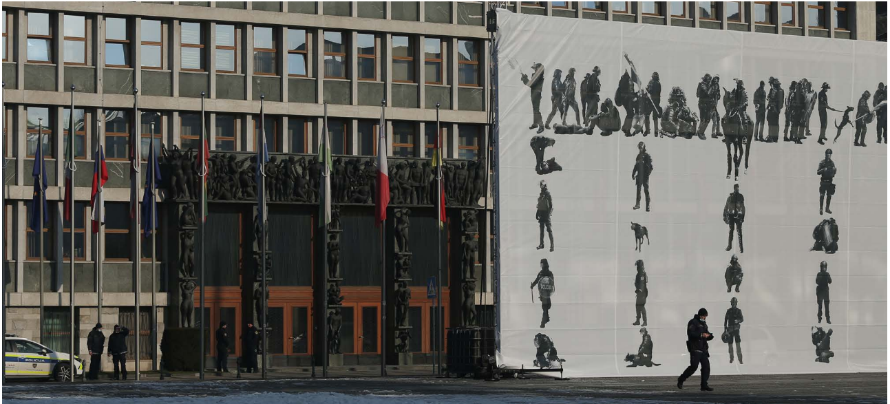
Allegory by NON-GRUPA

Plans for the Democracy Pavilion were first drawn up some months ago. However, with the current Russian's army invasion of Ukraine in our minds, L'Internationale association wants to use this platform to stand in solidarity with the Ukrainian people and condemn the military invasion that affects the lives of millions of civilians.